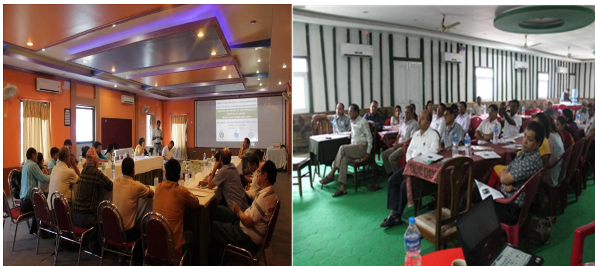
Figure 5: Participants at the Planning Meeting Workshop (Nepalgunj left and Bharatpur right)

A half day Planning Meeting was organized at Nepalgunj and Bharatpur on 11th July and 13th July 2014 at Hotel New Indreni (Nepalgunj) and Hotel Gongotri (Bharatpur) respectively. There were a total of 73 participants comprising of stakeholders and community that were the possible stakeholders