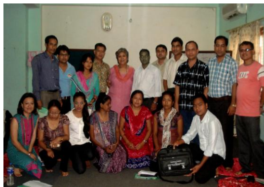
Figure 1: Participants at the MTotT, Nepalgunj

A twelve days MTOT training was organized on August 25 to September 5, 2013 at hotel New Indreni, Nepalgunj. Altogether, 21 trainers (9 female and 12 male) received the residential training and were capacitated to become master trainers to conduct UOSP facilitator's training by acquiring the relevant knowledge, attitude and skills necessary to implement the training in their concerned municipalities.