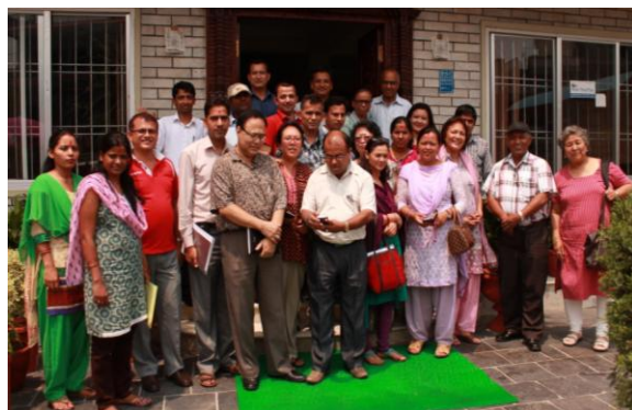
Figure 2: Participants at the Pokhara Consultation workshop